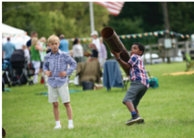
Boys throw "mock" cabers in a traditionally Scottish athletic competition.