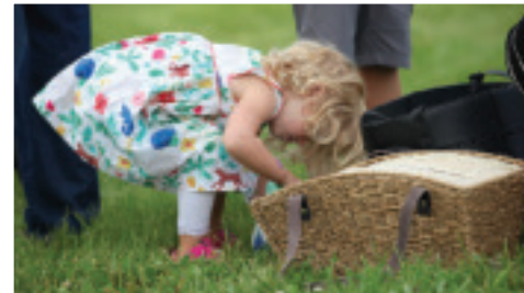
The joys of peeking into the picnic basket.