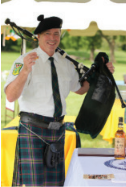
A Shannon Rovers bagpiper.