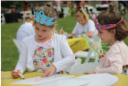
There were fun activities for all ages.