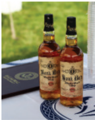
Balmoral Restaurant, Camden, Illinois donated a whiskey tasting.